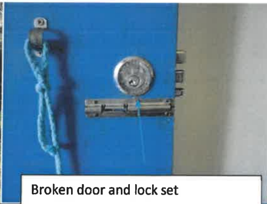
Broken door and lock set