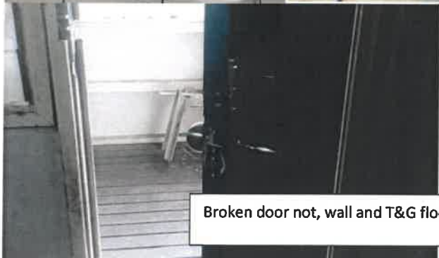
Broken door not, wall and T&G flooring.