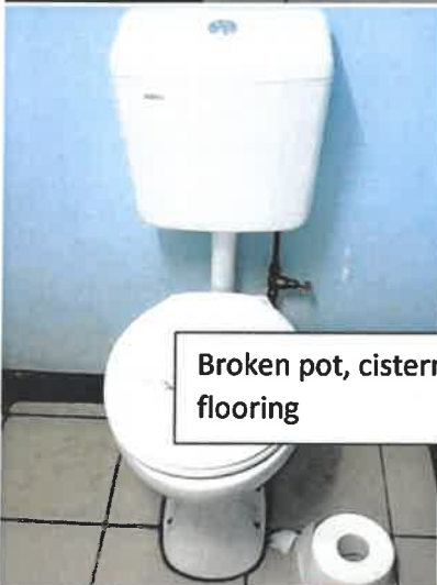
Broken pot, cistern and flooring