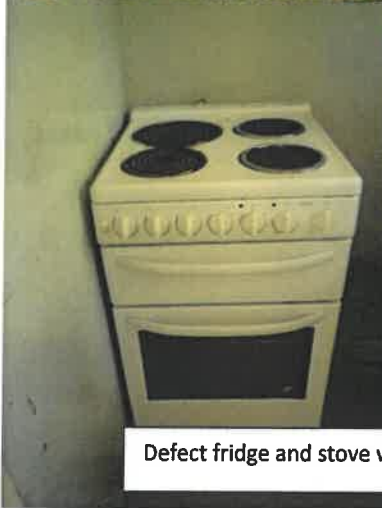
Defect fridge and stove with broken cupboards