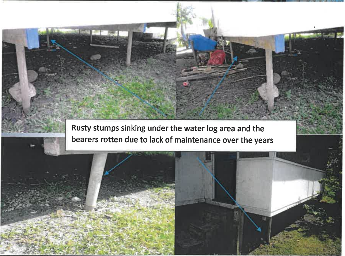
Rusty stumps sinking under the water log area and the bearers rotten due to lack of maintenance over the years